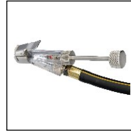
Core Retracting Tool