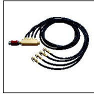
Manifold Kit - 4 Way