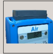
12V DC External Battery