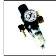
Air Filter / Auto-Drain / Regulator