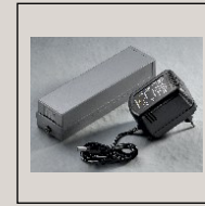
Desktop Charging Unit